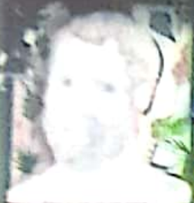
FATHER OF BOTANY