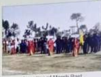
A section of March Past