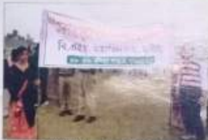
The cultural procession taken out in the college week

The College Week came to a close with a cultural procession.