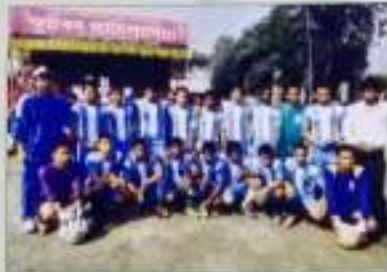
The B. H. College Football Team