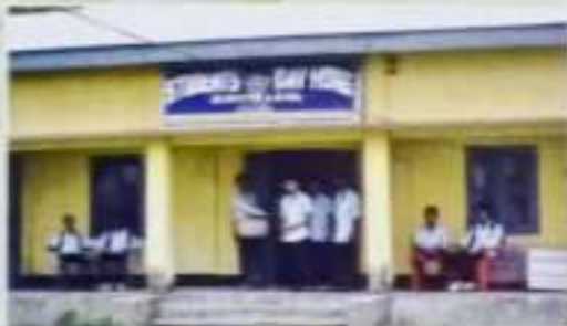
Students' Day Home