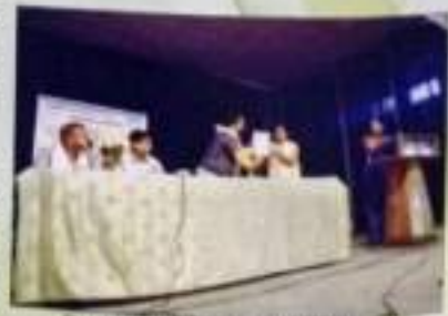
Distinguished Arts Graduates are felicitated by the Principal