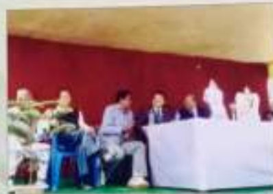
Dignitaries in the pavilion