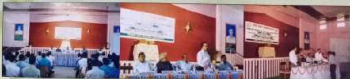
A glimpse of the workshop on New Methodology of NAAC Assessment