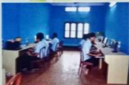
UGC Networking Centre