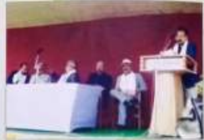
The Principal welcome the guests during the opening ceremony