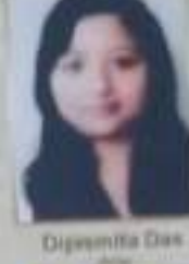
Dipamita Das Arts