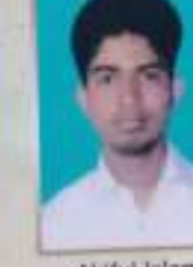
Akifur Islam Science