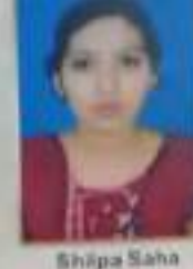
Shipra Saha Arts