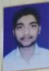
Javed Akhtar Science