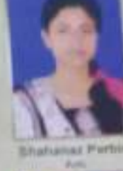
Shahamat Perbin Arts