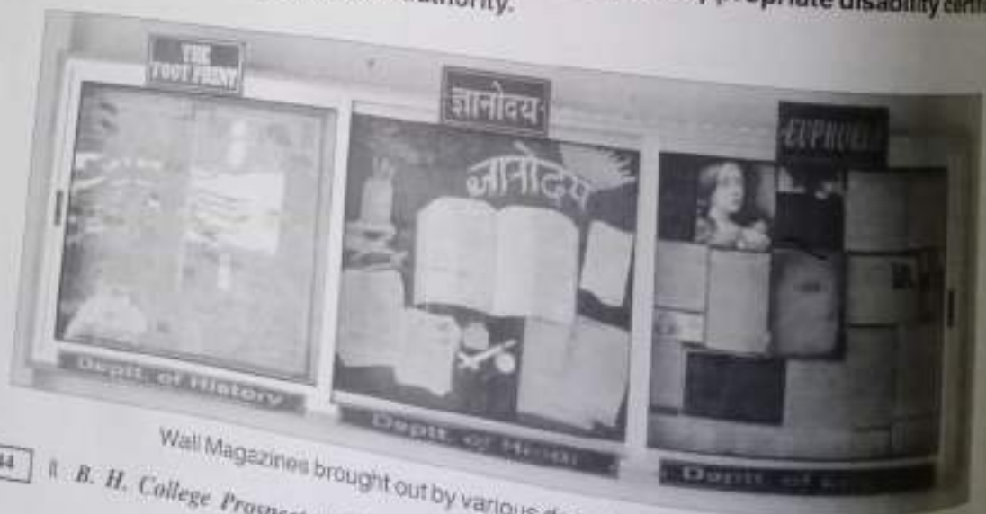
Wall Magazines brought out by various departments of the college.

N.B. : Differently abled students (Divyang) will enjoy fee exemption/ concession on the submission of written application with appropriate disability certificate issued by competent authority.