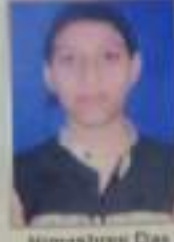
Himasitree Das Arts