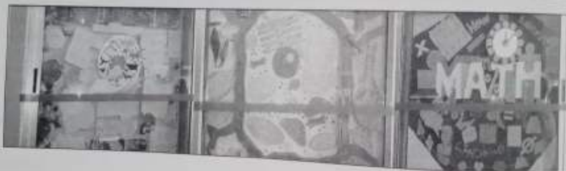
Wall Magazines brought out by various departments of the college.