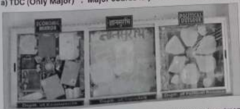
Wall Magazines brought out by various departments of the college.

a) TDC (Only Major) : Major course is yet to be opened in this subject.