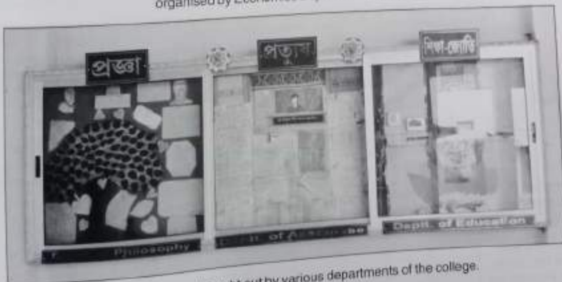
Wall Magazines brought out by various departments of the college.