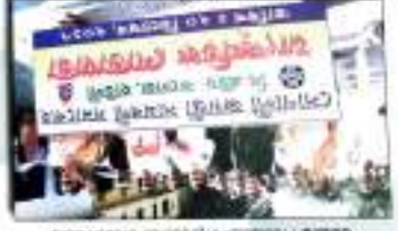
As the procession marches in