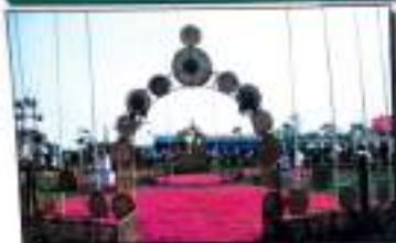
Flag Hoisting venue of the concluding ceremony of Golden Jubilee, 19 - 21 December, 2017