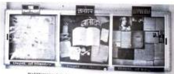
Wall Magazines brought out by various departments of the college.

N.B. : Differently abled students (Divyang) will enjoy fee exemption/ concession on the submission of written application with appropriate disability certificate issued by competent authority.