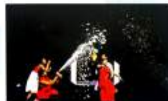
B. H. College Team during a drama performance in G.U. Inter College Youth Festival, 2017