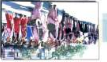
in traditional attire