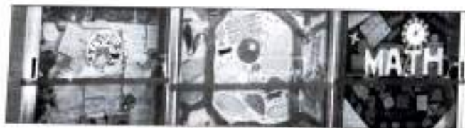
Wall Magazines brought out by various departments of the college.