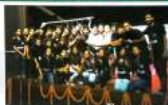
The participants of B. H. College Team in G.U. Inter College Youth Festival, 2017