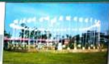
A view of the 50 fluttering flags