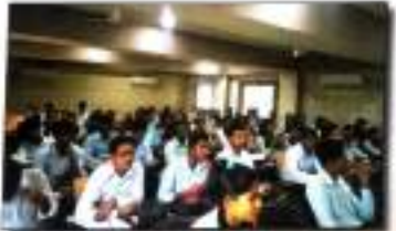
A section of the participants