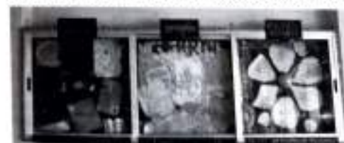
Wall Magazines brought out by various departments of the college

a) TDC (Only Major) : Major course is yet to be opened in this subject.