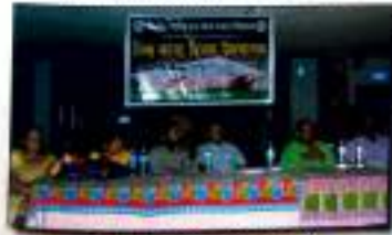
Observance of World Poverty Day