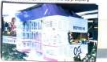
A view of the main stage during the last of the cultural procession