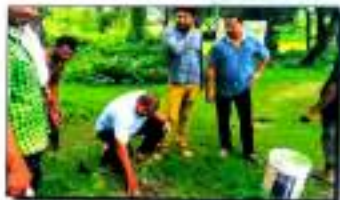
Some teachers are seen as planting saplings