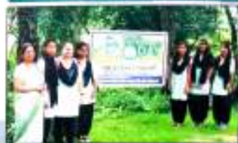
Observance of World Environment Day, 5th June, 2017