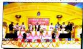
After the release of books