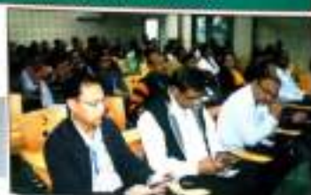
A section of the participants of the Short Term Programme