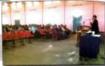
A glimpse of the audience