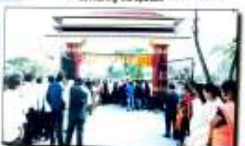
The crowd after the inauguration of the Golden Jubilee Gate