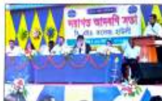
A moment of the Freshers' Social