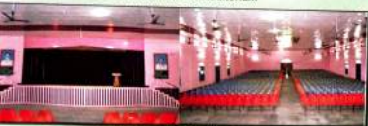
Inside view of the Auditorium