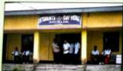
Students' Day Home