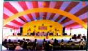
A view of the Golden Jubilee Stage