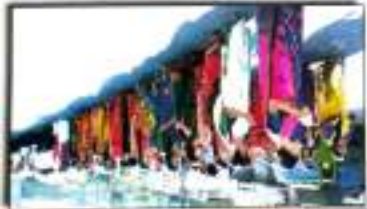
As the procession reaches ahead