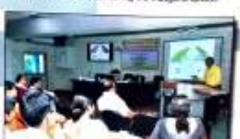
A moment of the National Seminar organized by the Department of Zoology in June, 2017