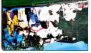
A show of the procession in the region of