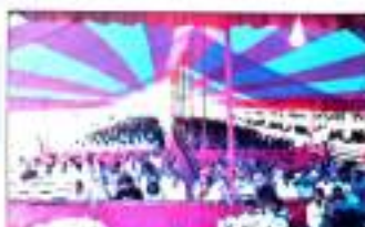
A glimpse of the audience during Freshers' Social