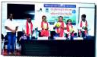
A moment of the National Seminar organized by the Department of Assessment in June, 2017.