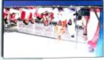
Another moment of the cultural program