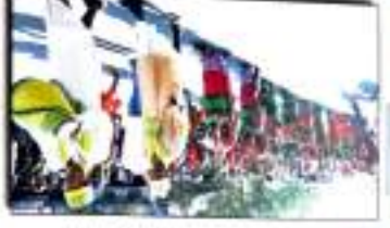
A segment of the procession