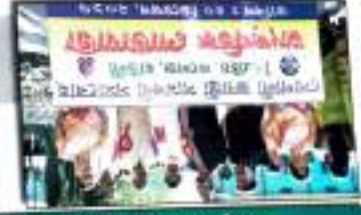
Cultural Procession of Indian States