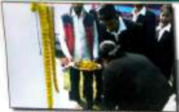
Paying tributes to martyrs. Annual College Week, 2017-18