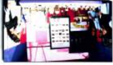
A Source of the exhibition