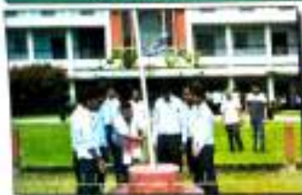
Flag Hoisting at Freshers' Social, August, 2017