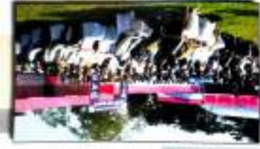
On one of the progresses