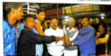
Prize distribution of Day-8th's voluntary Competition organized as part of golden jubilee celebration