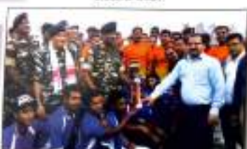
Prize distribution after the match