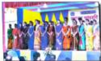
Chorus performed by students during the Open Session of Freshers' Social, August, 2017