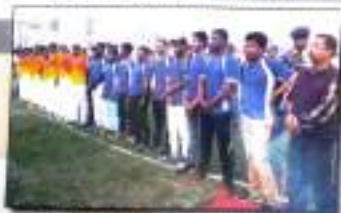
Players of two teams at the opening of the football match between CHSY and B. H. College