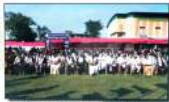
A section of the audience during Flag Hoisting