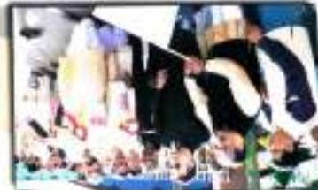
Traditional Musical Instruments of the Cultural Procession in presence of Jan Dutt