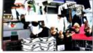
London Band of Physics Department