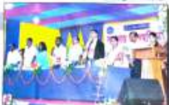
Welcoming speaker to the Acem Sangeet during Freshers' Social