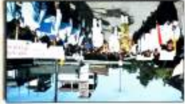
Audience as they watch during the cultural procession