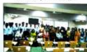
Resource Persons and the participants in the National Seminar organized by departments of Philosophy