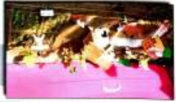
A part of the exhibition