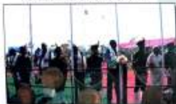
50 Flags are being unfurled together