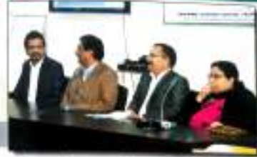
Inaugural Ceremony of Short Term Programme on Teaching Learning organised by IQAC