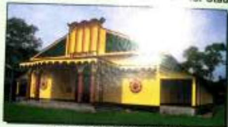
Front view of the Auditorium