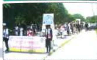
B. H. College Team took part a cultural procession in G.U. Inter College Youth Festival, 2017