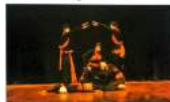
B. H. College Team performing a dance in G.U. Inter College Youth Festival, 2017