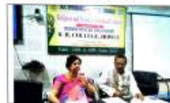
Inaugural Session of the National Seminar organized by department of Philosophy