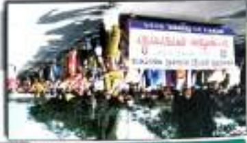
A view of the cultural procession