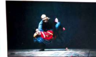
Some snapshots of students participating in various competitions of GU Inter College Youth Festival in 2018. The B. H. College Team bagged a total of 9 Prizes in different categories including 1st Prizes in Folk Orchestra & Folk Music, 2nd Prizes in Chorus, Folk Song and Modern Song. The B. H. College Team was adjudged the 3rd Best Team in the Youth Festival