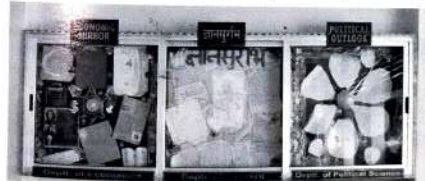
Wall Magazines brought out by various departments of the college.

a) TDC (Only Major) : Major course is yet to be opened in this subject.