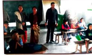
Special Teaching Programme done by the teachers of B. H. College in Primary Schools of neighbouring villages