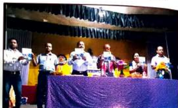
Release of Dunari, journal of the Assamese department