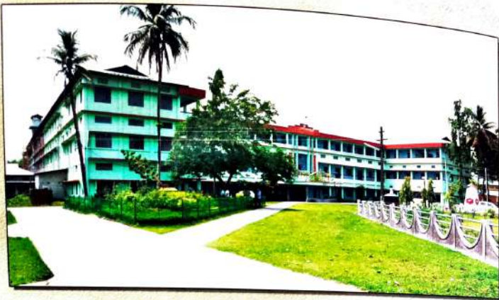
Front view of main building of the college