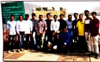
Pictures of the students and teachers going for the Govt. sponsored Rajasthan Trip as part of the tourism initiatives of the Govts. of Assam and Rajasthan