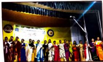
A glimpse of the Miss B. H. Competition held during the college week