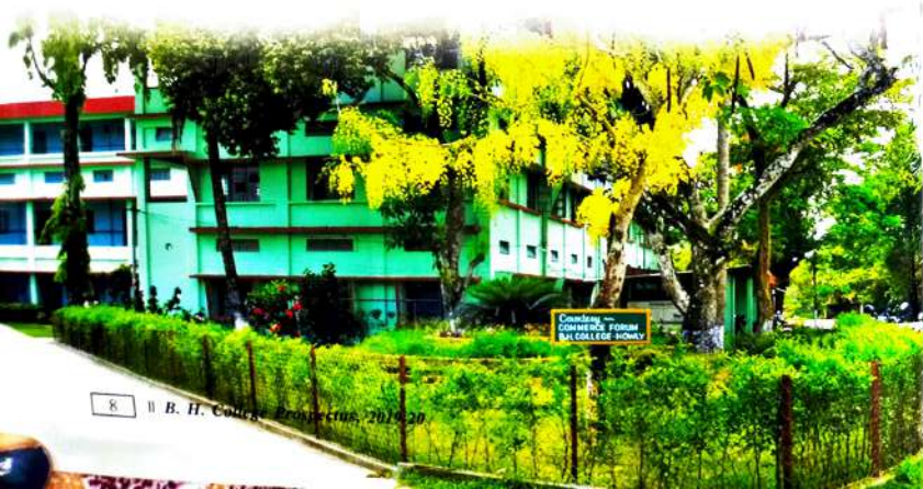
8 || B. H. College Prospectus, 2019-20

Besides, it endeavours to set an example of unity and integrity among different sections of people of the locality.