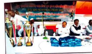
Prize distribution ceremony of Indu Hazarika Inter-District Football Tournament held at B. H. College