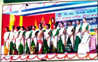
Chorus during the Open Session of Annual College Week 2018-19