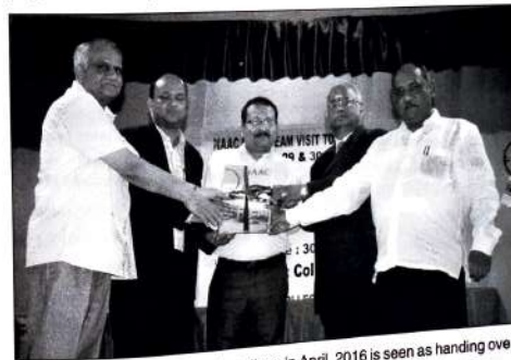
The NAAC Peer Team visiting the college in April, 2016 is seen as handing over the Peer Team Report (PTR) to the Principal and Co-ordinator, IQAC.