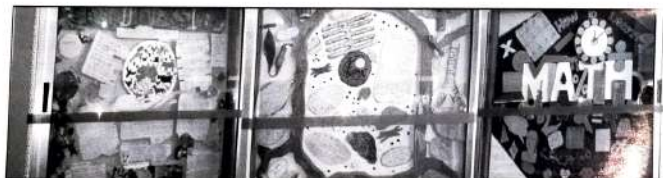
Wall Magazines brought out by various departments of the college.