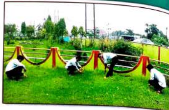
NSS Volunteers cleaning the College compound