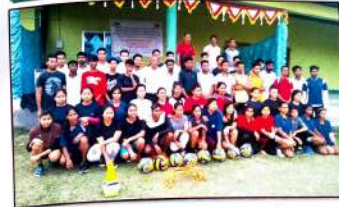
A 15 day Volleyball Coaching Programme was conducted under the initiative of 'Khelo India' at B. H. College Playground from 22 Feb. – 6 March, 2019