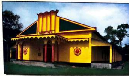
Front view of the Auditorium