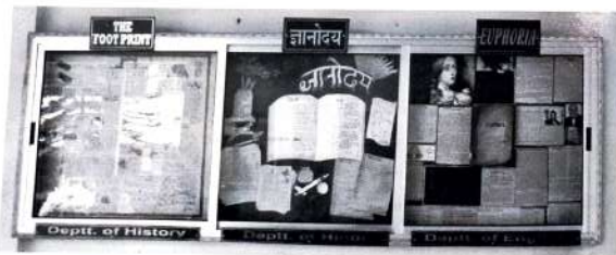
Wall Magazines brought out by various departments of the college.

N.B. : Differently abled students (Divyang) will enjoy fee exemption/ concession on the submission of written application with appropriate disability certificate issued by competent authority.