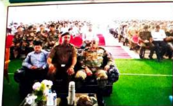
NCC Orientation Programme at B. H. College with the participation of 15 institutions from Assam