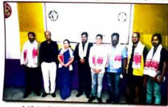
A 16 day National Workshop sponsored by National School of Drama, New Delhi was held at B. H. College from 13 – 28 March, 2019 on the topic 'Inquiry-based Teaching Learning through Drama/Theatre'