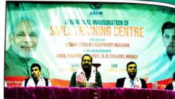
The State level Ceremonial Inauguration of Skill Training Centre under Assam Skill Development Mission was organized at B. H. College on 5th March, 2019. Sjt. Hrishikesh Goswami, Hon'ble Media Adviser to the Chief Minister, Assam was the Chief Guest in the function attended by other dignitaries